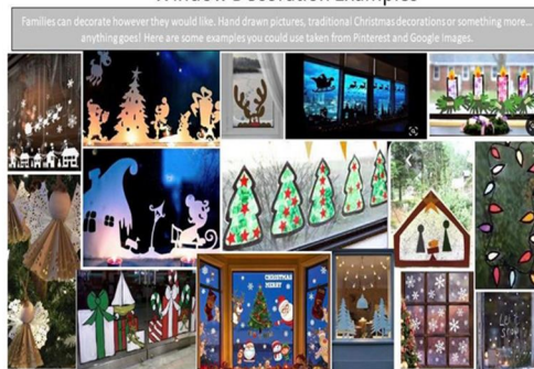
Window Decoration Examples

www.pta-events.co.uk/four-oaks-primary/index.cfm#.X74QDuTfUIQ